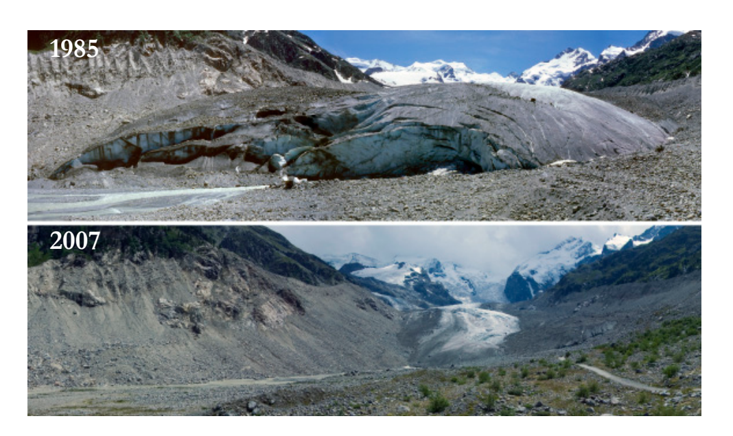
Morteratsch glacier (Alps).