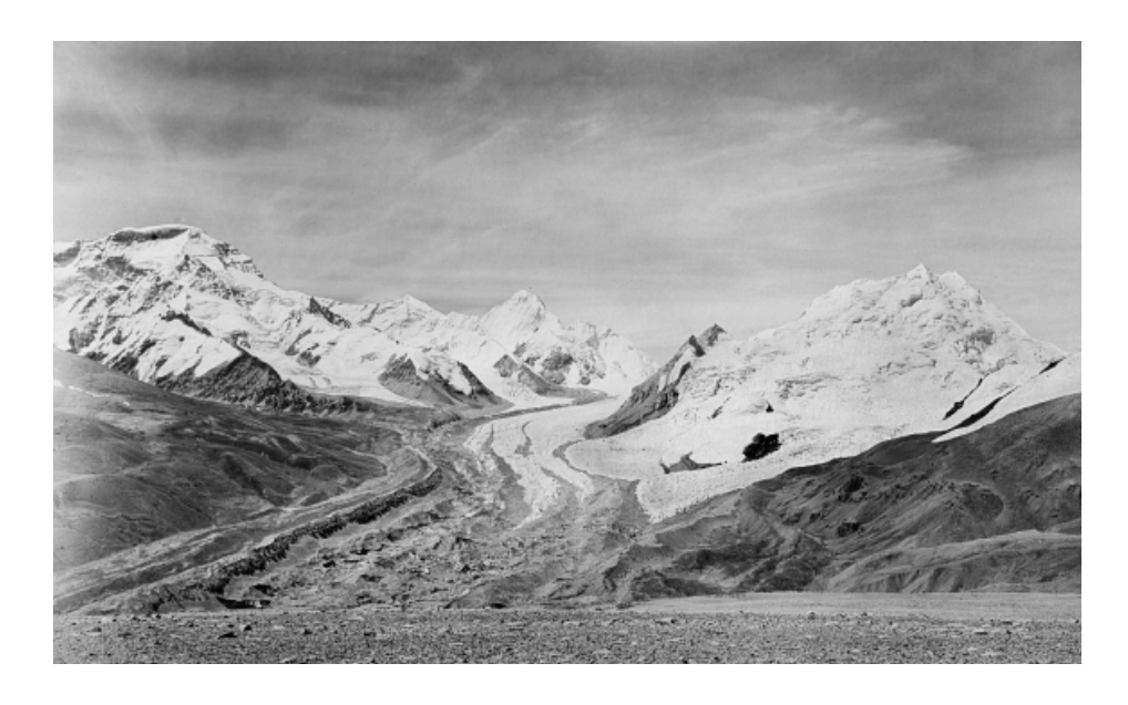
Kyetrak Glacier 1921. Location: Cho Oyu, 8201 m, Tibet Autonomous Region; Eastern Himalayas. Elevation of Glacier: 4,907 – 5,883 m.