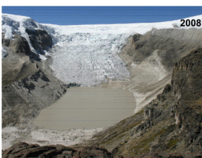
Qori Kalis outlet glacier (the largest outlet glacier from the Quelccaya Ice Cap in the southern Andes of Peru).