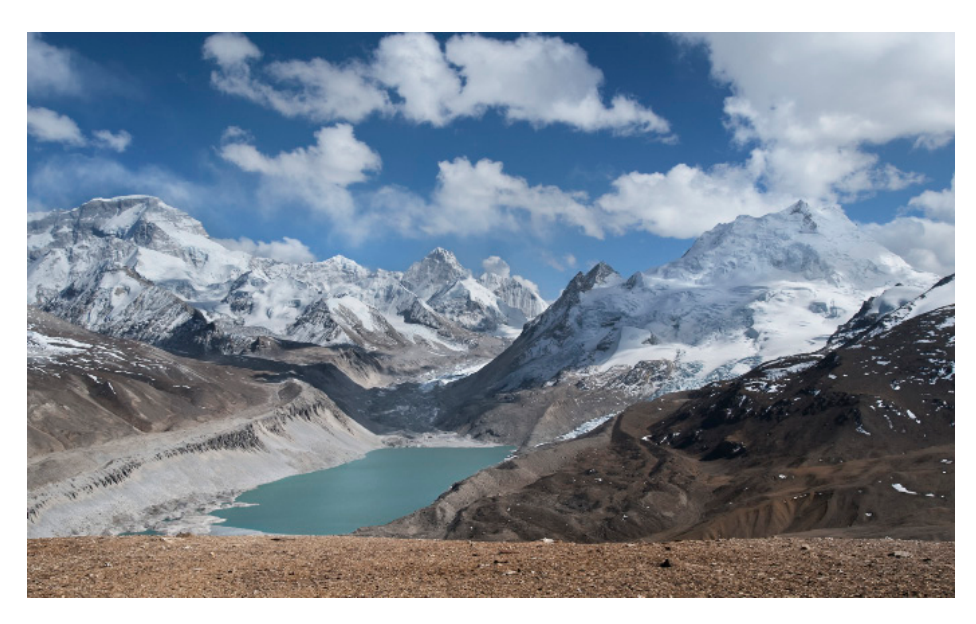
Kyetrak Glacier 2009